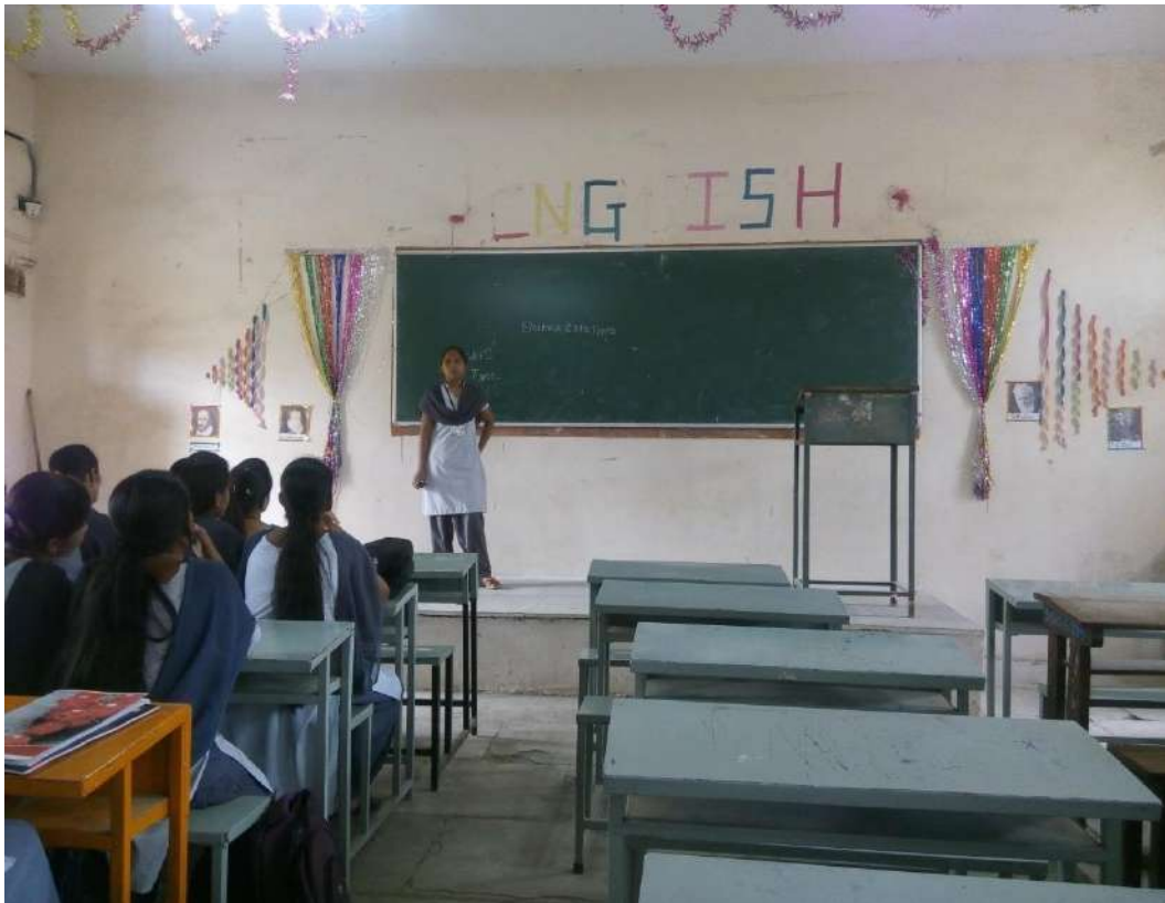
Student giving seminar