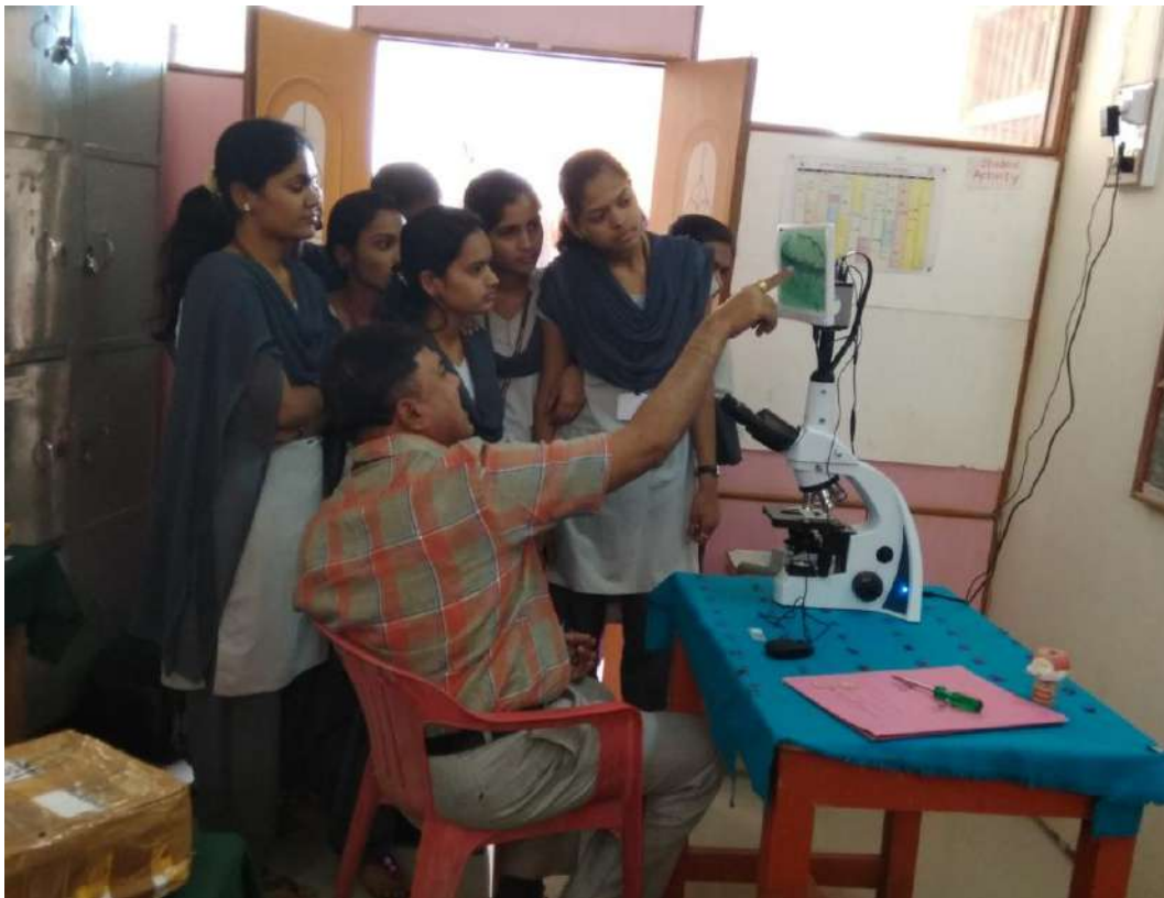
Microscope with screen