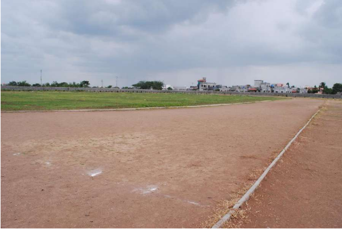
8 lane 400 meter track