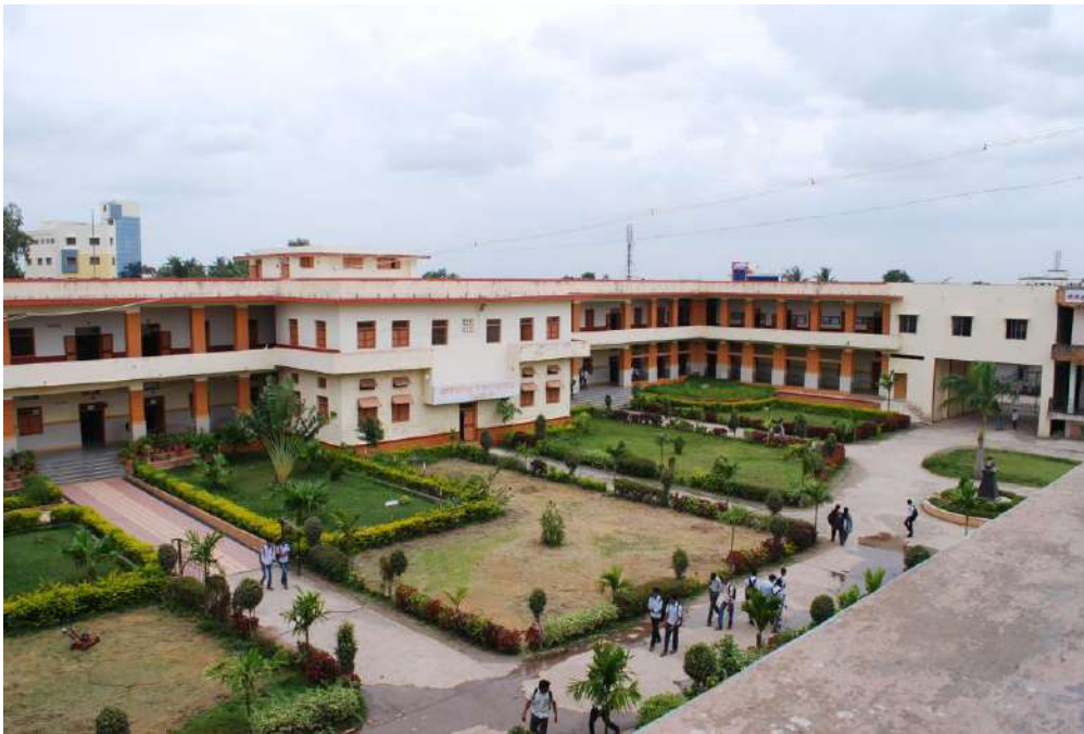
Internal view of college building