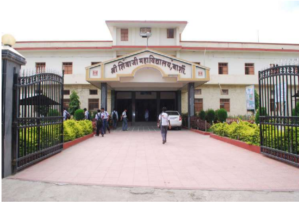
Entrance of the College