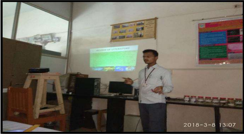
Presentation by student