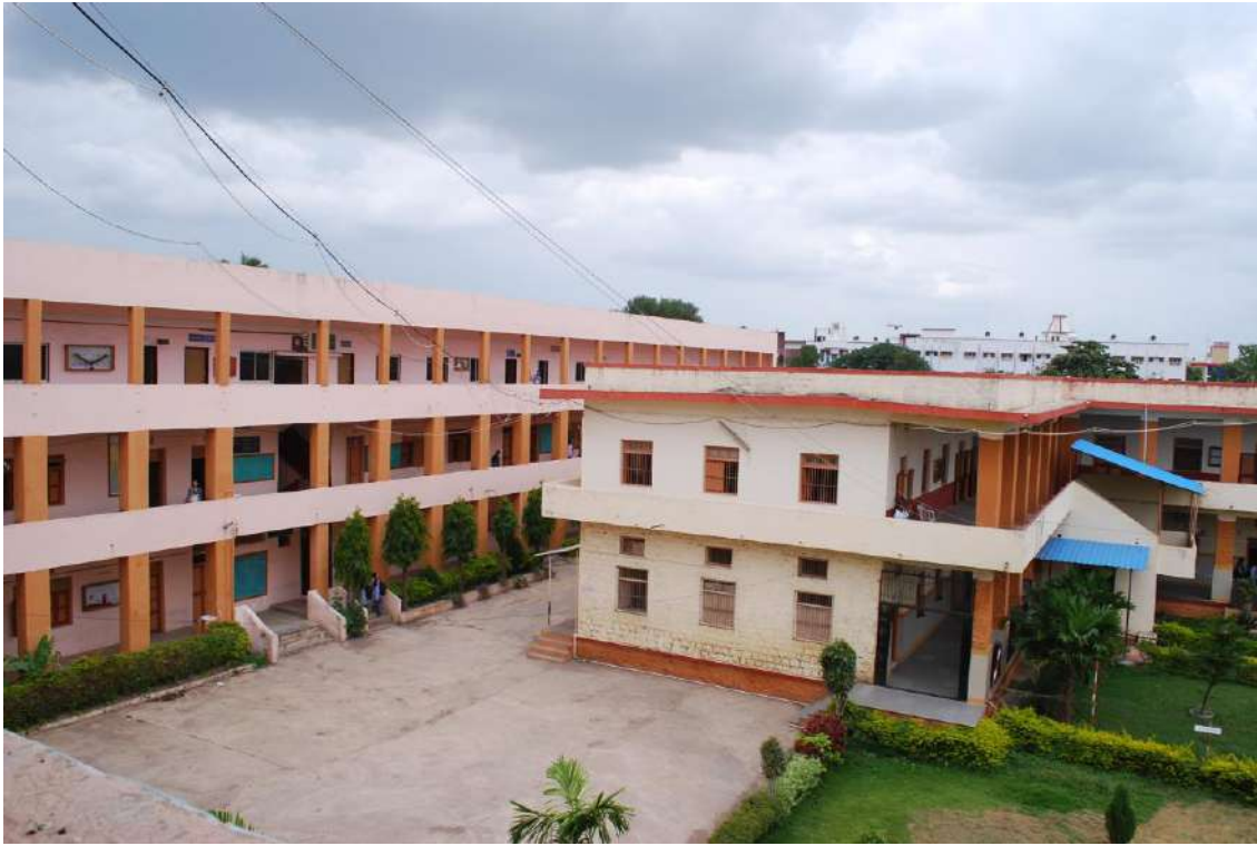
Side view of college building