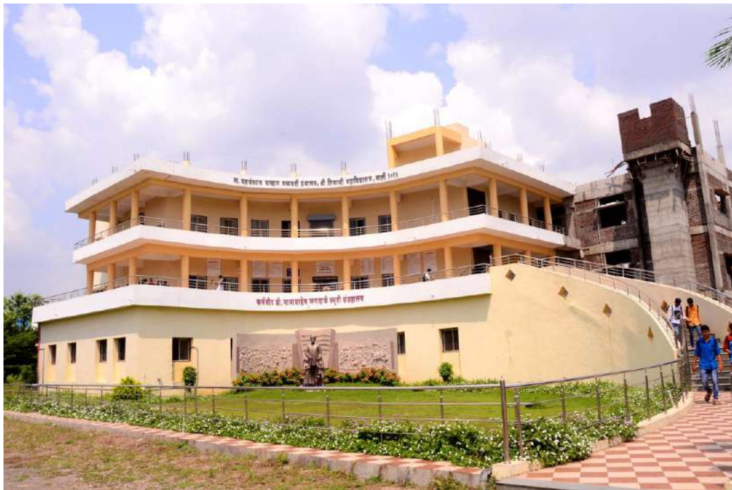
Yashwantrao Chavan Central Library