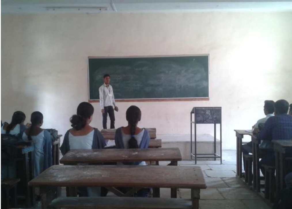
Student giving seminar