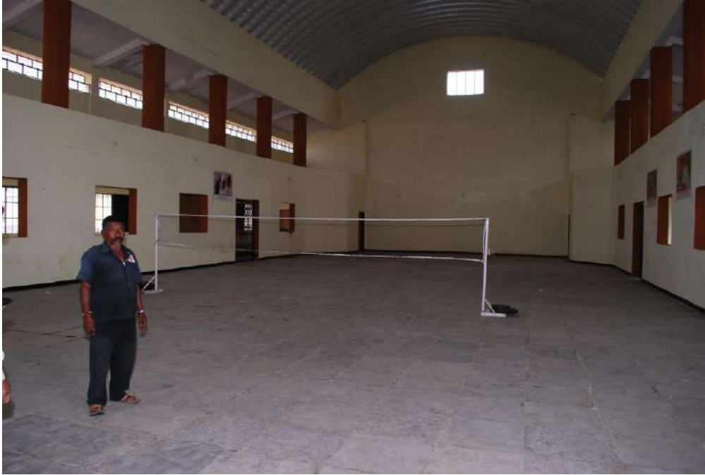
Indoor stadium of college