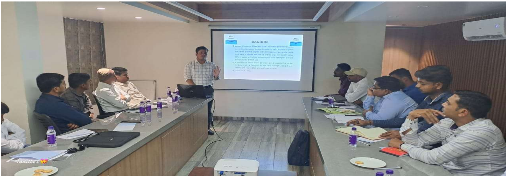
Industry Academy Meet